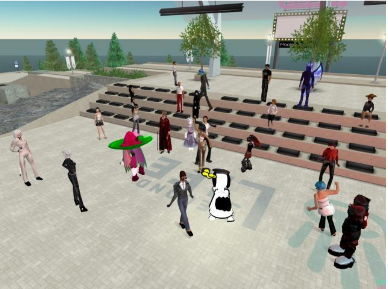
Second Life round table community meeting - showing various avatars dancing and socialising.

in Snow Crash ( Stephenson 1992 ) to post apocalyptic, cyber-punk weaponry to rival anything from science fiction film or literature. But, the focus of the environment is far from combat. Although there are some areas set aside for combat the core philosophy is to live and let live with most areas forbidding disruptive or abusive behaviour. The whole experience is based around personal, self-motivated, exploration and discovery of both the environment and your co-residents. The lack of pre-defined goals allows a greater range of action and expression with a much greater emphasis on residents getting together to create their own content. A recent SL event mirrored the relay for life charity walk for the American Cancer Society and had 1,000 participants and raised $40,000 ( ACS, 2006 ). The activities of in-world commerce are significant enough to be covered by Business week ( Hof 2006 ) and are measured in hundreds of thousands of US dollars, currently the in-world currency the Linden dollar is appreciating against the US currency.